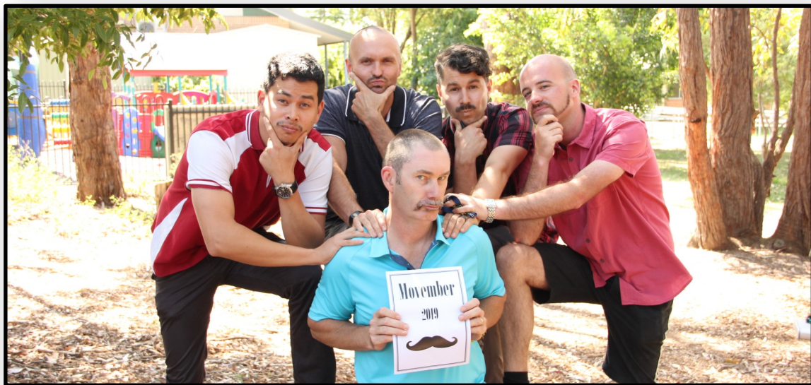
The RPS 'Mo Bros'

This is the latest progress shot of our impressive 'mos'.