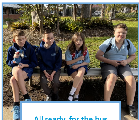
All ready for the bus