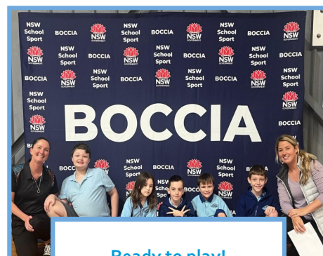
Ready to play!